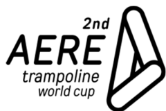
FIG TRAMPOLINE WORLD CUP BRESCIA (ITALY) – 27 – 28 APRIL 2018